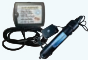
UV ozone system for advanced water management