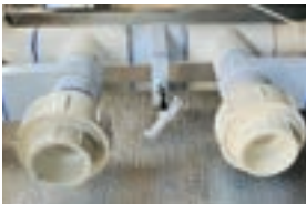
Heat pump ready