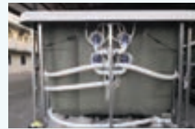
Heavy duty galvanised steel frame with side and seat supports