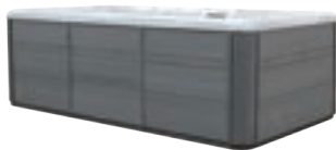
Thermo-wood maintenance free cabinet