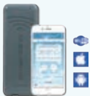
Optional SmartLink app control

Straight from our Somersby Showroom Over 40 years of experience Australian designed and owned Servicing NSW-wide