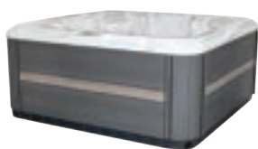
Thermo-wood maintenance free cabinet