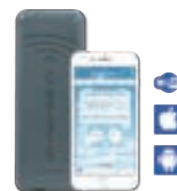
Optional SmartLink app control

Straight from our Somersby Showroom Over 40 years of experience Australian designed and owned Servicing NSW-wide