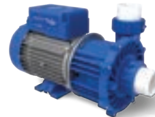
SpaNET system for efficient, low running costs