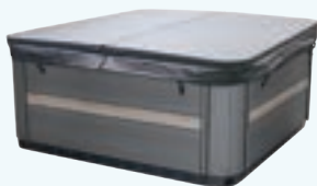
High density lockable cover