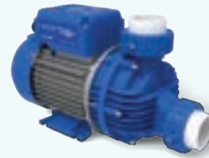
Reliable, energy-efficient high-flow filtration pump