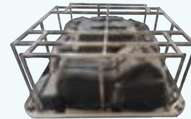
Stainless Steel frame with side and seat supports