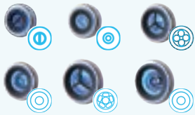
Premium self-cleaning LED jets