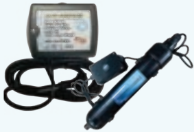
UV ozone system for advanced water management