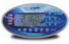
Australian smart SpaNET SV control system

We stand behind every spa we sell, combining over 40 years of experience with proven components designed for Australian conditions. Our team will help you choose the right spa with confidence – backed by local support and straightforward advice.