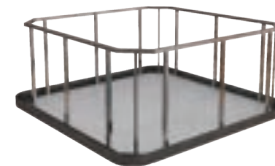
Wraparound base to protect against vermin and weather