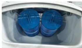
Top loading filters – easy to clean