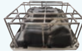
Galvanised Steel frame with side and seat supports