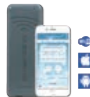
Optional SmartLink app control

Straight from our Somersby Showroom Over 40 years of experience Australian designed and owned Servicing NSW-wide