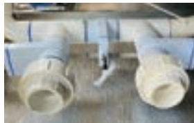
Heat pump ready