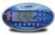
Australian smart SpaNET SV control system

We stand behind every spa we sell, combining over 40 years of experience with proven components designed for Australian conditions. Our team will help you choose the right spa with confidence – backed by local support and straightforward advice.